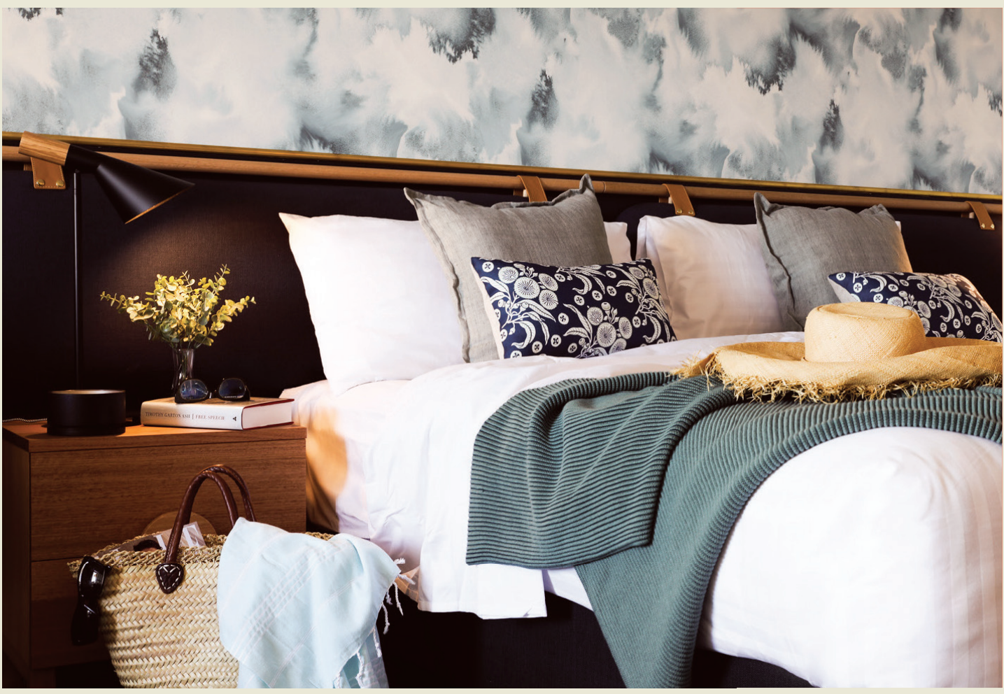
Boutique District View